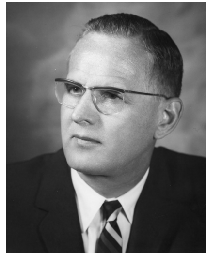
Figure 2. Maclyn McCarty.

This coincided with an idea that Roger Herriott described in a letter to Hershey: