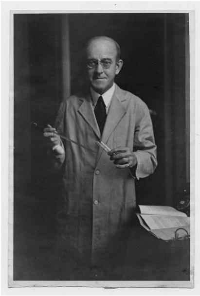
Figure 1. Oswald T. Avery in 1944.

in Escherichia coli and in November 1945 reported that in this species, too, the transforming agent was “a highly polymerised thymonucleic acid”. Boivin’s conclusion was explicit: “we should now look to the nucleic acid component of the giant nucleoprotein molecule that forms a gene, rather than to the protein part, to find the inductive properties of the gene” [20].